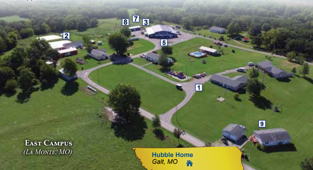
EAST CAMPUS (LA MONTE, MO)