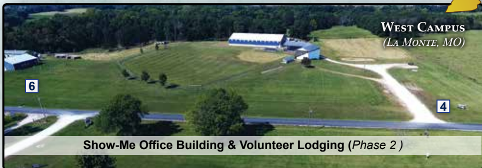
WEST CAMPUS (LA MONTE, MO)